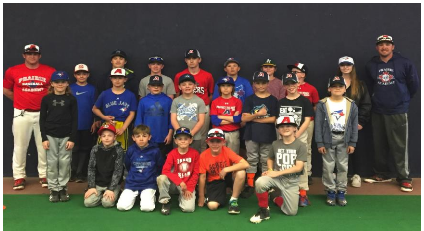
2017 PBA Spring Training Camp

There will be a short break at the end of October, which will be followed by an extensive conditioning program. Each player will be expected to attend every workout session up to an hour and a half hour per-day until the Christmas break. Following the fall season the Prairie Baseball Academy starts up a Winter Elite Camp for local youth players. The PBA Winter Elite Camp has become one of the best camp programs in Alberta. The camp runs five nights per week with sessions for player's ages 7-18. Academy players are asked to volunteer their time one night every week to help develop youth baseball in Lethbridge and surrounding communities. The campers love being able to interact and learn from the players and coaches in the program.