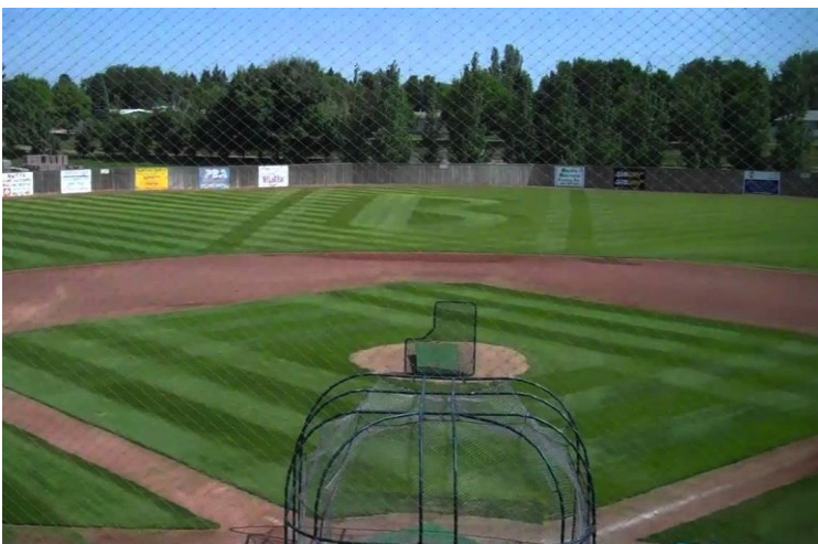
Lloyd Nolan Yard

We are very proud of our baseball facilities. Lloyd Nolan Yard is the home of the Prairie Baseball Academy. Lloyd Nolan has a beautiful playing surface that is maintained by the players throughout the year. Inside, upstairs, there is a baseball space with turf and two full-length cages that pull out. Downstairs there is another bullpen pitching lane with three full clay mounds. Also downstairs there is a weight room and a locker room for both the Varsity and Junior Varsity players. Along with our facilities we have a tremendous spring schedule where the Varsity team competes against some of the top Junior College's in the U.S. Each spring the Varsity team heads to Las Vegas to start the season in the College of Southern Nevada's Icebreaker tournament. The ten-day trip to Vegas during spring break is always a memorable trip for PBA players.