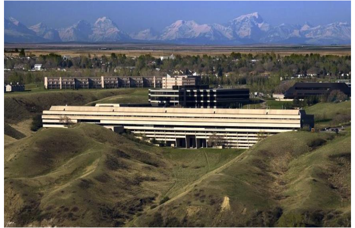
University of Lethbridge Campus

As a prospective student athlete at the Prairie Baseball Academy there are a few things you need to know. The first thing that is absolutely imperative is that all new players are coming to the Prairie Baseball Academy to further their education. Although the PBA has been established, as a program that provides the opportunity to play baseball at a high level it must be understood the tremendous sacrifice it will take to be successful here. Education must come first. The reality is that you must be successful in the classroom in order to be able to play college baseball.