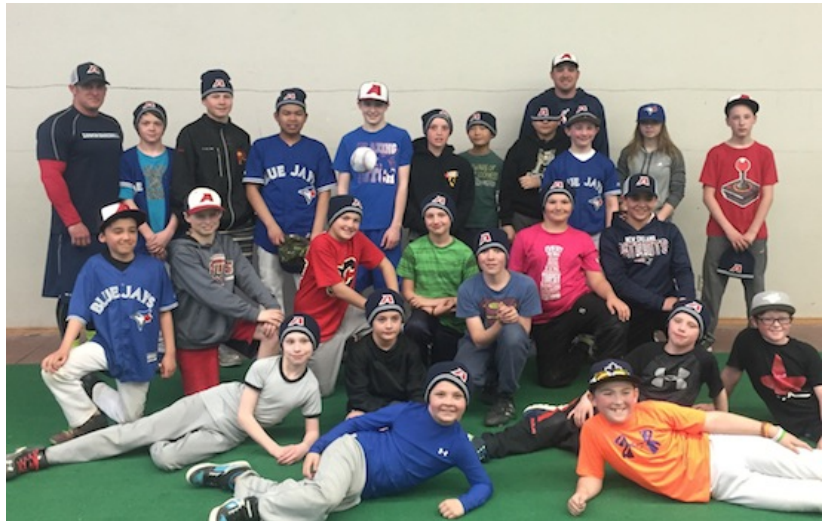
2016 PBA Spring Training Camp

There will be a short break at the end of October, which will be followed by an extensive conditioning program. Each player will be expected to attend every workout session up to an hour and a half hour per-day until the Christmas break. Following the fall season the Prairie Baseball Academy starts up a Winter Elite Camp for local youth players. The PBA Winter Elite Camp has become one of the best camp programs in Alberta. The camp runs five nights per week with sessions for player's ages 7-18. Academy players are asked to volunteer their time one night every week to help develop youth baseball in Lethbridge and surrounding communities. The campers love being able to interact and learn from the players and coaches in the program.