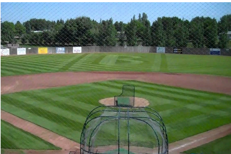
Lloyd Nolan Yard

We are very proud of our baseball facilities. Lloyd Nolan Yard is the home of the Prairie Baseball Academy. Lloyd Nolan has a beautiful playing surface that is maintained by the players throughout the year. Inside, upstairs, there is a baseball space with turf and two full-length cages that pull out. Downstairs there is another bullpen pitching lane with three full clay mounds. Also downstairs there is a weight room and a locker room for both the Varsity and Junior Varsity players. Along with our facilities we have a tremendous spring schedule where the Varsity team competes against some of the top Junior College's in the U.S. Each spring the Varsity team heads to Las Vegas to start the season in the College of Southern Nevada's Icebreaker tournament. The ten-day trip to Vegas during spring break is always a memorable trip for PBA players.