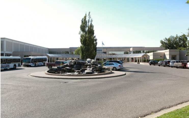
Lethbridge College Campus

The Prairie Baseball Academy was founded in 1995 as a program designed to help young athletes in Canada pursue post-secondary education while continuing their baseball careers. To date the Prairie Baseball Academy has over 700 alumni spread across Canada from coast to coast. Over 130 players have gone onto four-year schools in the United States and close to 30 PBA alumni have played professional baseball after their time in the program.