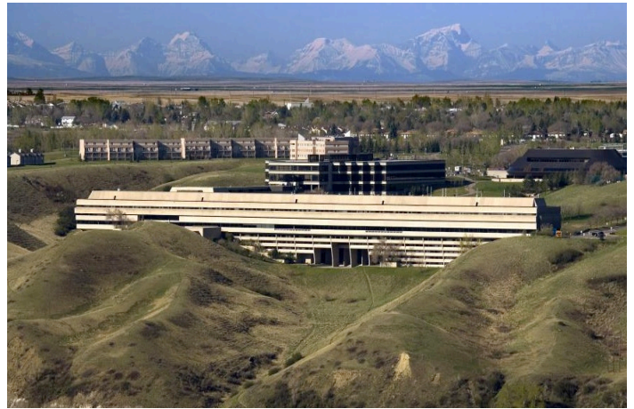
University of Lethbridge Campus

As a prospective student athlete at the Prairie Baseball Academy there are a few things you need to know. The first thing that is absolutely imperative is that all new players are coming to the Prairie Baseball Academy to further their education. Although the PBA has been established, as a program that provides the opportunity to play baseball at a high level it must be understood the tremendous sacrifice it will take to be successful here. Education must come first. The reality is that you must be successful in the classroom in order to be able to play college baseball.