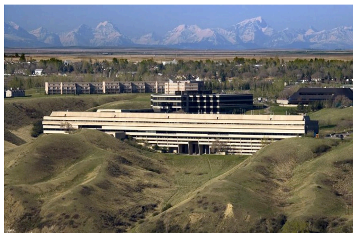
University of Lethbridge Campus

Education must come first. The reality is that you must be successful in the classroom in order to be able to play college baseball.