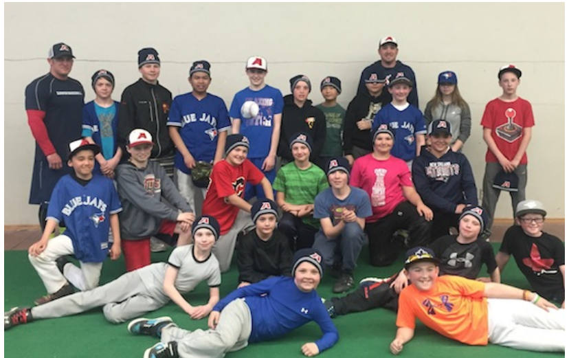
2016 PBA Spring Training Camp

There will be a short break at the end of October, which will be followed by an extensive conditioning program. Each player will be expected to attend every workout session up to an hour and a half hour per-day until the Christmas break. Following the fall season the Prairie Baseball Academy starts up a Winter Elite Camp for local youth players. The PBA Winter Elite Camp has become one of the best camp programs in Alberta. The camp runs five nights per week with sessions for player's ages 7-18. Academy players are asked to volunteer their time one night every week to help develop youth baseball in Lethbridge and surrounding communities. The campers love being able to interact and learn from the players and coaches in the program.