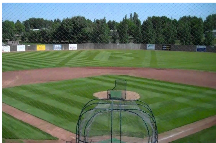
Lloyd Nolan Yard

We are very proud of our baseball facilities. Lloyd Nolan Yard is the home of the Prairie Baseball Academy. Lloyd Nolan has a beautiful playing surface that is maintained by the players throughout the year. Inside, upstairs, there is a baseball space with turf and two full-length cages that pull out. Downstairs there is another bullpen pitching lane with three full clay mounds. Also downstairs there is a weight room and a locker room for both the Varsity and Junior Varsity players. Along with our facilities we have a tremendous spring schedule where the Varsity team competes against some of the top Junior College's in the U.S. Each spring the Varsity team heads to Las Vegas to start the season in the College of Southern Nevada's Icebreaker tournament. The ten-day trip to Vegas during spring break is always a memorable trip for PBA players.