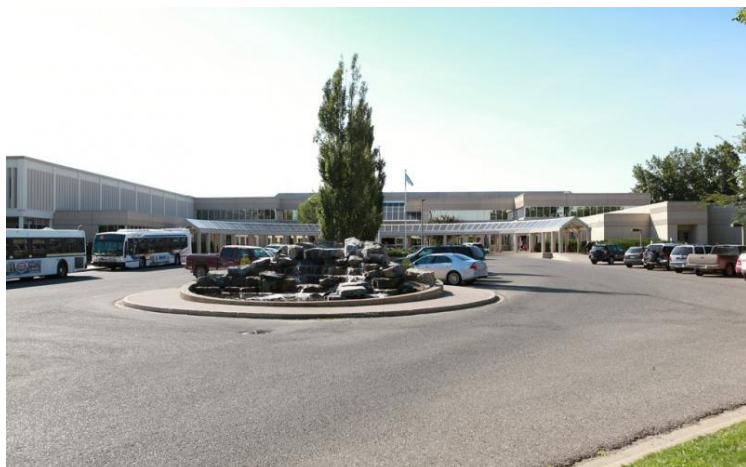
Lethbridge College Campus

The Prairie Baseball Academy was founded in 1995 as a program designed to help young athletes in Canada pursue post-secondary education while continuing their baseball careers. To date the Prairie Baseball Academy has over 700 alumni spread across Canada from coast to coast. Over 130 players have gone onto four-year schools in the United States and close to 30 PBA alumni have played professional baseball after their time in the program.